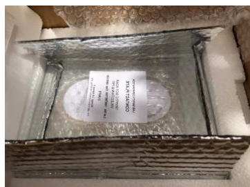
3 Testing Plates – Need to be refrigerated

If you have any questions, please check out our Unboxing Video or call our office at 202.955.5010.